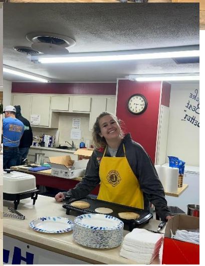
Top: (L-R) Kensington, Norton, Hugoton Bottom Left and Middle: MWR Service Project.