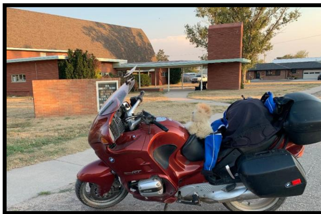
Watch for the motorcycle with the Lion driving! You will know 2VDG Jeremy is in town when you see this!

New Website Check out the all-new District 17-K Website!