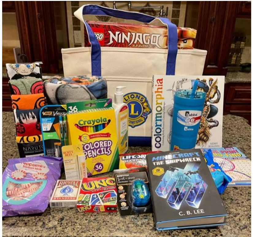
Examples of Cancer Bags given to area children

Each bag has all the main items used while going through chemotherapy. In addition, they contain coloring books (adult or child level) and a stuffed Lion with a shirt that has our logo and says "Fight Like a Lion on the front. If we know specifics on the child, we add special items we know they will like. The bag is given to the club requesting it to present to the family from the local club.